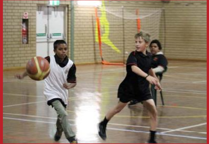
Enjoying early morning basketball training.