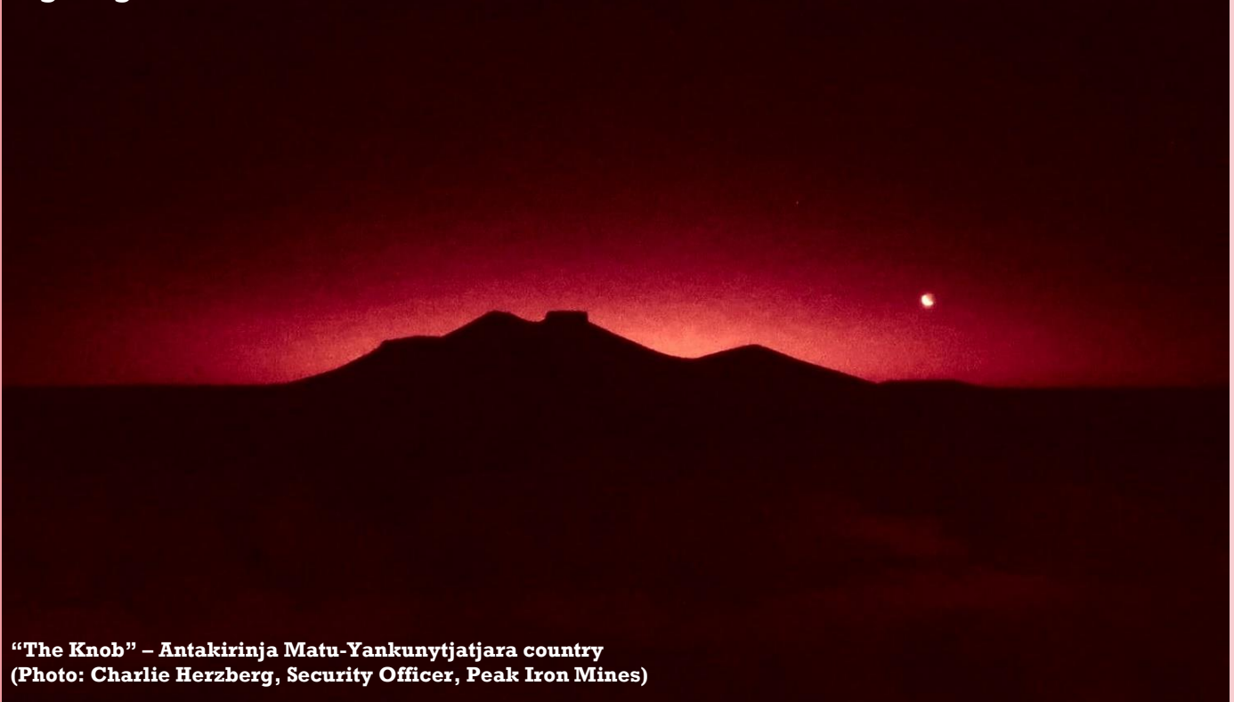
“The Knob” – Antakirinja Matu-Yankunytjatjara country