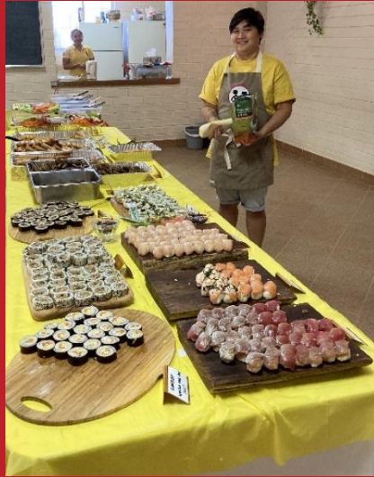
So much fabulous food!!