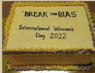
The fabulous cake, thanks to CK Confectionaire Bakery...

The "Sisters" group is a network of women across Coober Pedy – including young mothers with babies and women from LGBTQ+ backgrounds – who work on issues around domestic and family violence and abuse. After two years of challenges, isolation, financial hardships, floods from record breaking rain in the region, and disruption to services and supplies due to road closures, approximately 100 women gathered to raise their voices for a world free of bias, stereotypes, and discrimination against women.