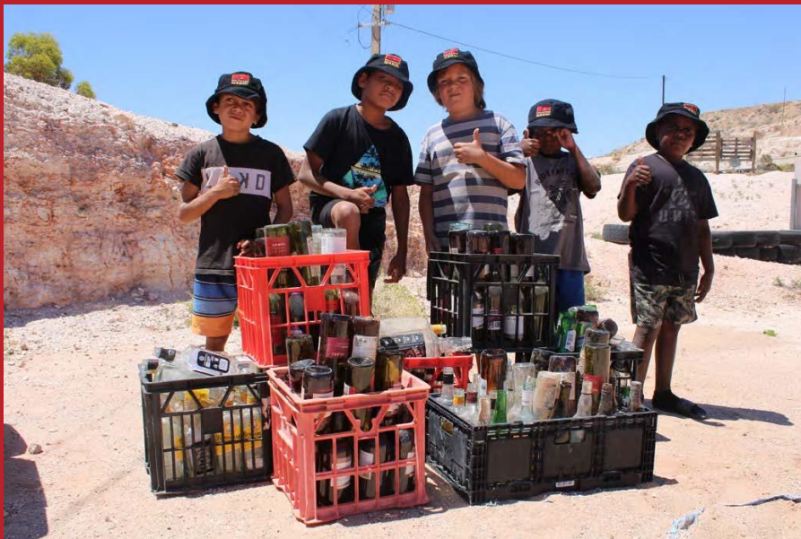
Collecting recyclables in and around Coober Pedy community.