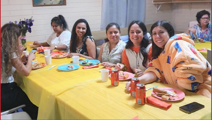
Thank you to all the "sisters" who set up and celebrated the women of Coober Pedy!