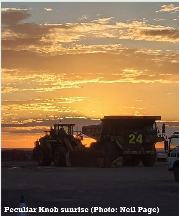
Peculiar Knob sunrise