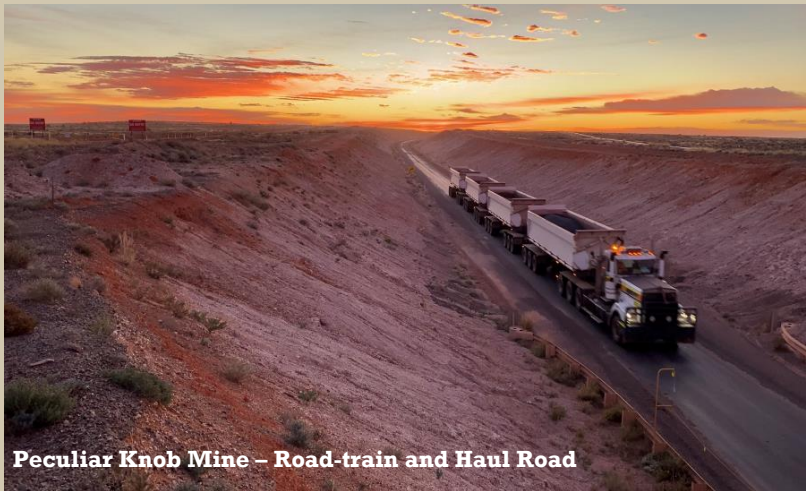
Peculiar Knob Mine – Road-train and Haul Road

Peak Iron Mines acknowledges the traditional owners of country throughout Australia and their continuing connection to land, culture, and community. We pay our respects to Elders past, present and emerging.