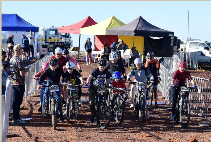
Children's bike race about to start!