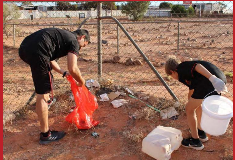
Clontarf students carrying out community service by collecting rubbish in and around the community.