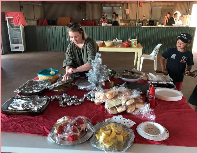
Xmas spread at the annual catchup in Glendambo...