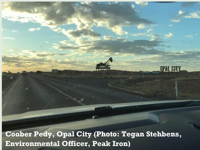
Coober Pedy, Opal City

Peak Iron Mines is happy to sponsor such an initiative and looks forward to joining the Coober Pedy community in their celebrations.