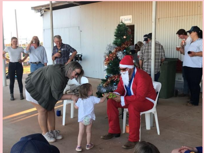
Gifts for the children from Santa!