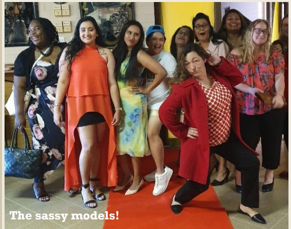
The sassy models!

In future, the "Sisters" group intends to hold regular bingo games at one of the clubs in town as a social outing for community members.