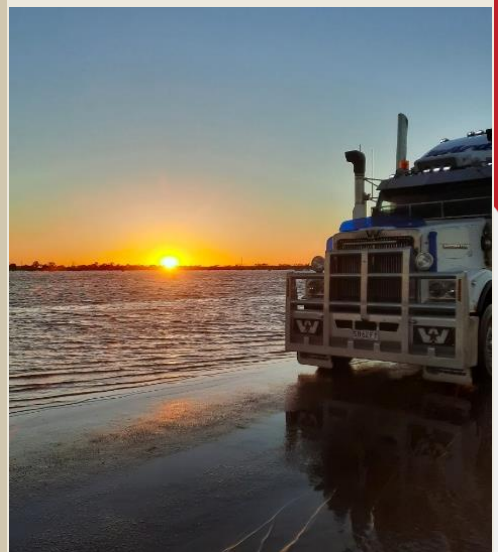
Glendambo Lake!! (February 2022)