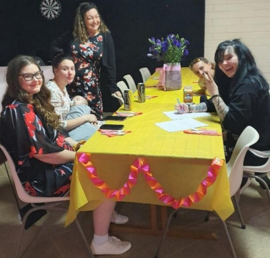
"Sisters" enjoying the IWD Event!