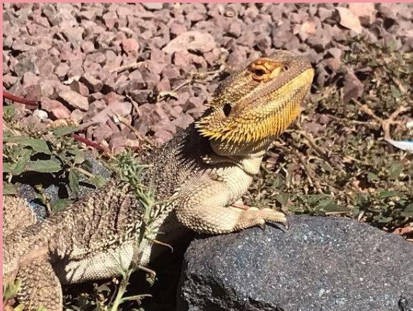
Peculiar Knob resident – Arnold the lizard...