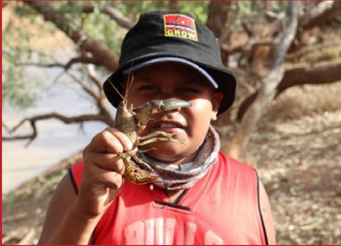
Clontarf students catching yabbies at Mabel Creek!