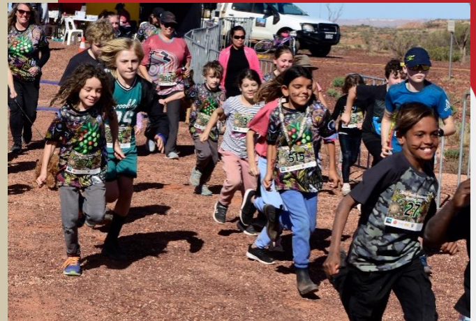
Children's running race. And they're off!!!