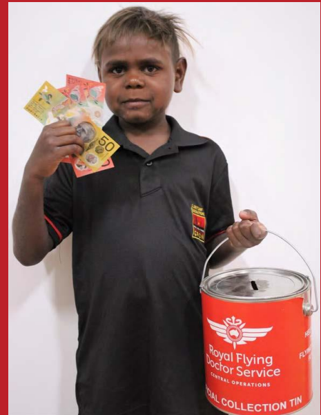
Donating the funds from recycling to the Royal Flying Doctor Service.