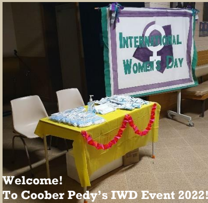
Welcome! To Coober Pedy's IWD Event 2022!