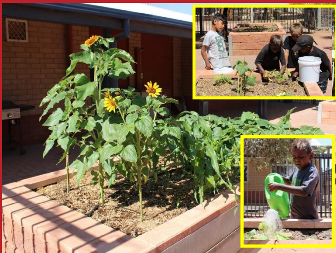
Unused garden beds in the Coober Pedy Area School grounds have been brought back to life!