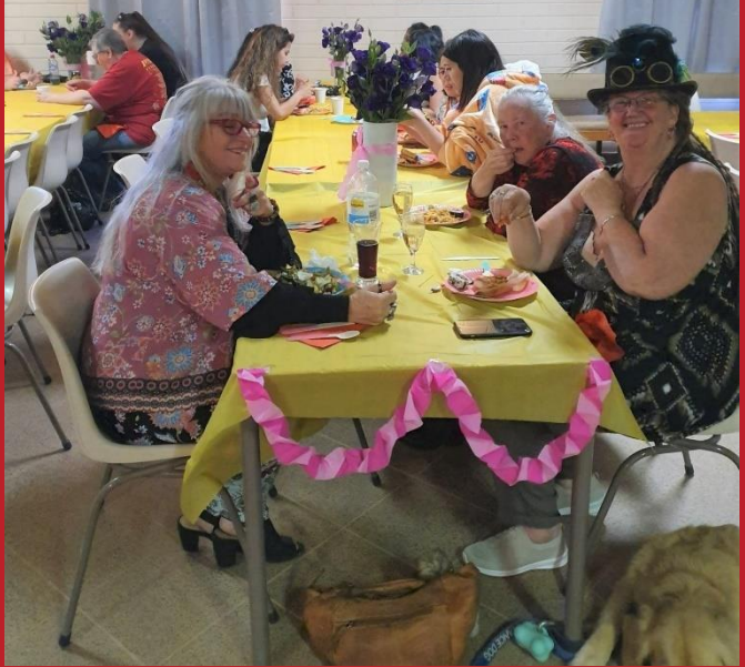
More fabulous "sisters" of Coober Pedy!