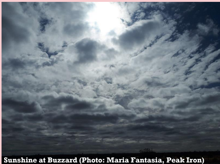
Sunshine at Buzzard

Thank you to pastoral lease holders and Native Title Holders for your cooperation re: this new venture for Peak Iron Mines.